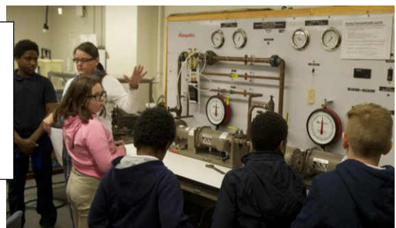
STEM ENGINEERING @ CLEVELAND STATE UNIVERSITY WASHKEWICZ COLLEGE OF ENGINEERING