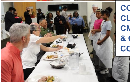
COOK-OFF @ CCC CULINARY INST. CMSD STUDENTS & CLEVELAND COPS